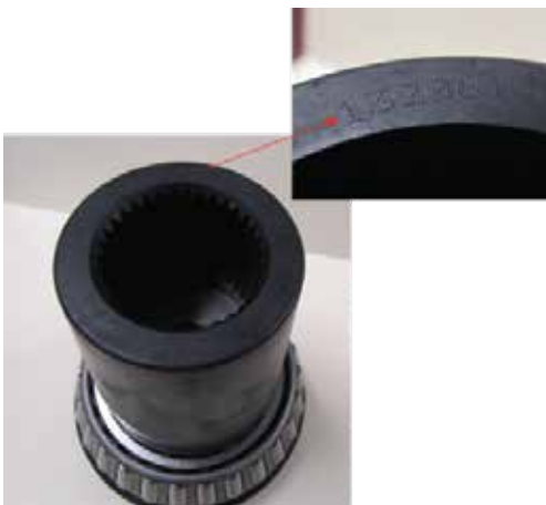
Before March 2018 – 6 Digit Part Number D590 Before November 2018 D156 Before July 2019