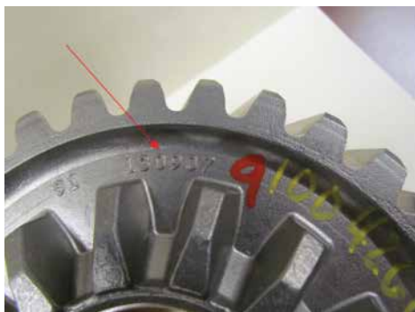
Before March 2018 – 6 Digit Part Number D590 Before November 2018 D156 Before July 2019