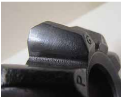
Before March 2018 – Square Tooth D590 Before November 2018 D156 Before July 2019