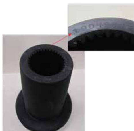
After March 2018 – 10 Million Part Number D590 After November 13, 2018 D156 After July 1, 2019