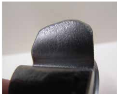
After March 2018 – Round Tooth D590 After November 13, 2018 D156 After July 1, 2019