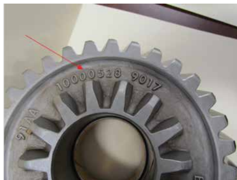
After March 2018 – 10 Million Part Number D590 After November 13, 2018 D590 After November 13, 2018