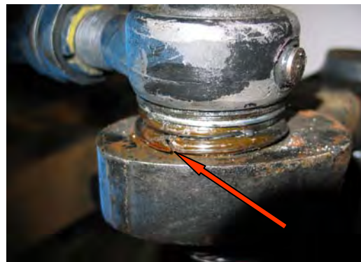
Cut in tie rod end boot