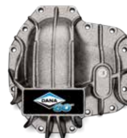
Spicer® Nodular Iron Differential Cover

Copyright Dana Limited, 2018. All rights reserved. Dana Limited, Dana and Ultimate Dana are registered trademarks of Dana Limited. Jeep and Wrangler are registered trademarks of FCA US LLC. The ARB 4x4 Accessories name and logos are trademarks of ARB Corporation limited. BFGoodrich, Krawler and T/A are trademarks and copyrights of Michelin North America, Inc. Currie AntiRock is a registered trademark of Currie Enterprises, Inc. The Mopar logo is a registered trademark of FCA US LLC. RI Rigid Industries LED Lighting is a registered trademark of Rigid Industries. Walker Evans Racing is a trademark of Walker Evans Enterprises Incorporated. WARN is a trademark of WARN Industries, Inc.