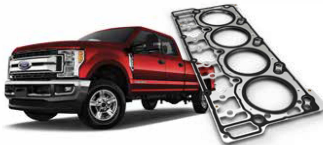
Ford Powerstroke® 6.0L Diesel