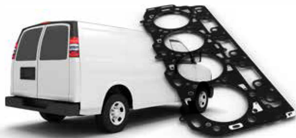
GM Duramax® 6.6L Diesel

When it comes to gaskets and sealing products, Victor Reinz is the brand that engine and vehicle manufacturers rely on – and the brand that repair shop and fleet owners can trust when delivery vehicles need repairs. Dana has been supplying Victor Reinz gaskets to original equipment manufacturers for decades, and supports aftermarket distribution around the world.